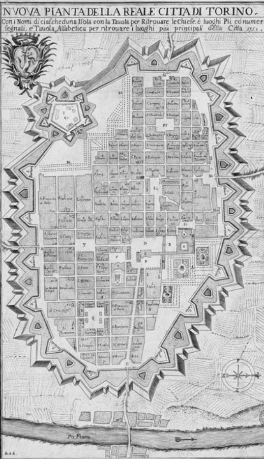
TAVOLA ALFABETICA DE' LUOGHI PRINCIPALI A Palazzo del Re, e Giardini B Palazzo Reale C Palazzo Reale D Palazzo Reale E Palazzo Reale F Palazzo Reale G Palazzo Reale H Palazzo Reale I Palazzo Reale L Palazzo Reale M Palazzo Reale N Palazzo Reale O Palazzo Reale P Palazzo Reale Q Palazzo Reale R Palazzo Reale S Palazzo Reale T Palazzo Reale U Palazzo Reale V Palazzo Reale X Palazzo Reale Y Palazzo Reale Z Palazzo Reale